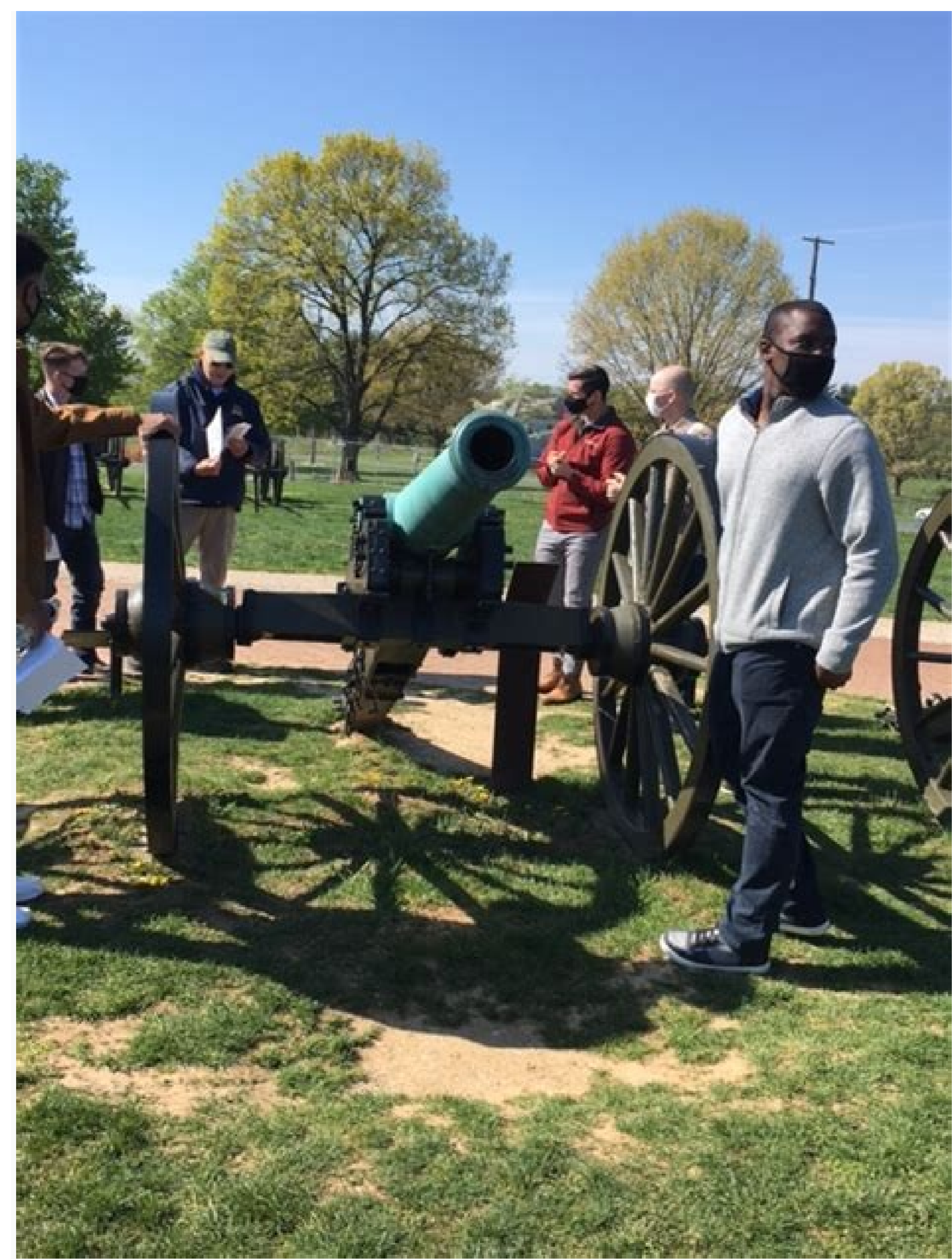
Antietam national battlefield tour guides.