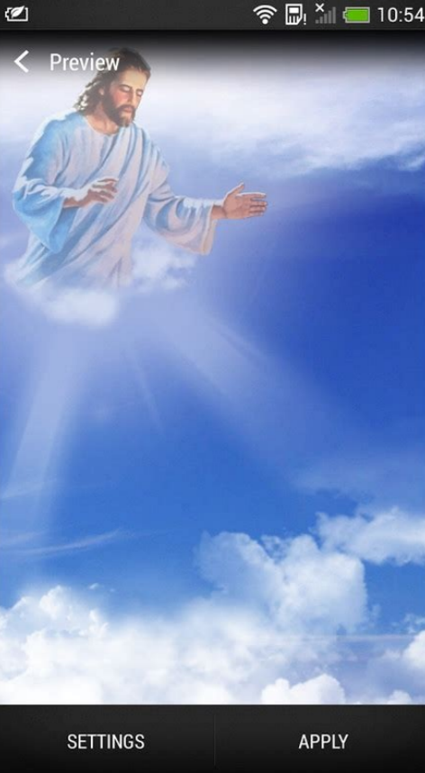
Interactive games for phones. Interactive wallpaper phone apps. How to get a interactive wallpaper. Interactive wallpaper android phone. How to make a interactive wallpaper. Interactive live wallpaper for phone. How to make interactive live wallpaper android.