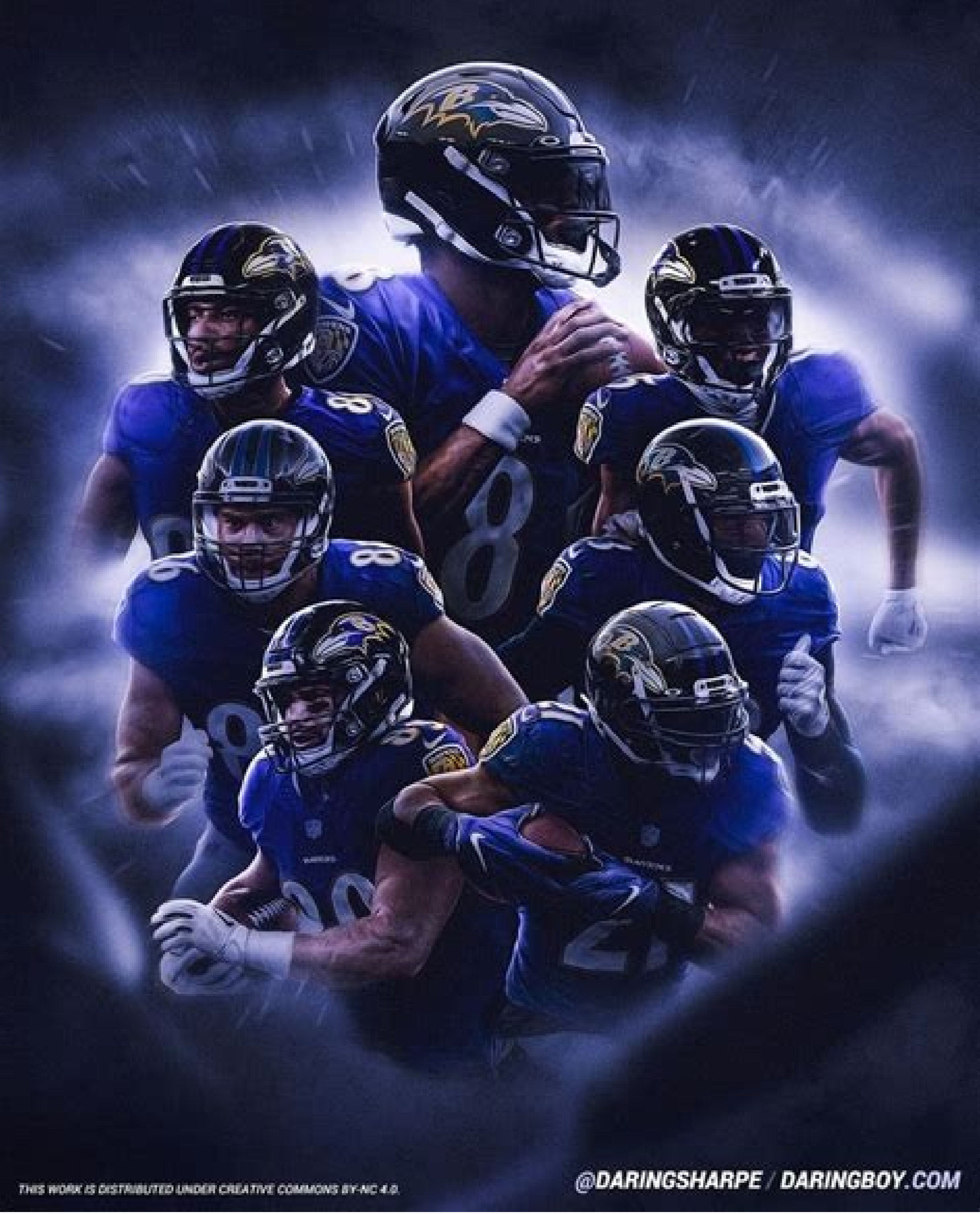
THIS WORK IS DISTRIBUTED UNDER CREATIVE COMMONS BY-NC 4.0 @DARINGSARPE / DARINGBOY.COM